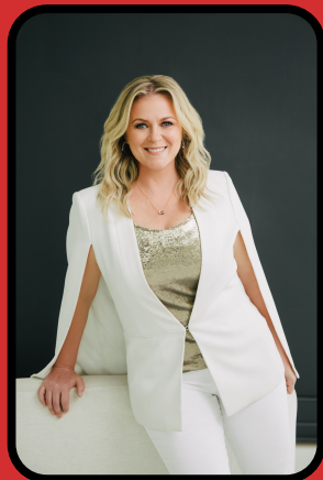
Carolyn Dawn Johnson

Carolyn is a Canadian country music singer-songwriter. Johnson co-wrote Chely Wright's 1999 single, "Single White Female," which reached number one on the Billboard Hot Country Singles & Tracks chart in September 1999. Johnson was signed, in 2000, to record label Arista Nashville. In 2001, Johnson released her debut album Room with a View. The album's first single "Georgia" reached No. 4 on the RPM Canadian Country Singles Chart for the week of November 6, 2000. "Complicated" was a Top Ten hit on the U.S. Billboard Hot Country Singles & Tracks chart. Her next single ("I Don't Want You to Go") was also a Top Ten hit in the U.S.